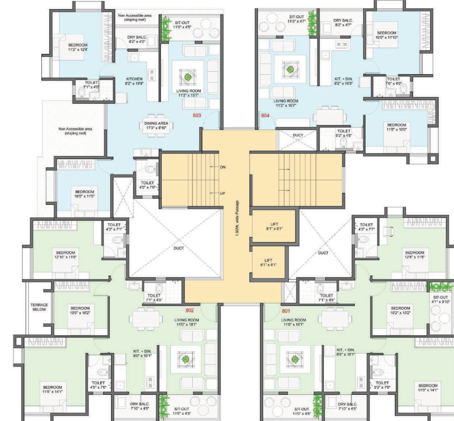
EIGHTH FLOOR PLAN