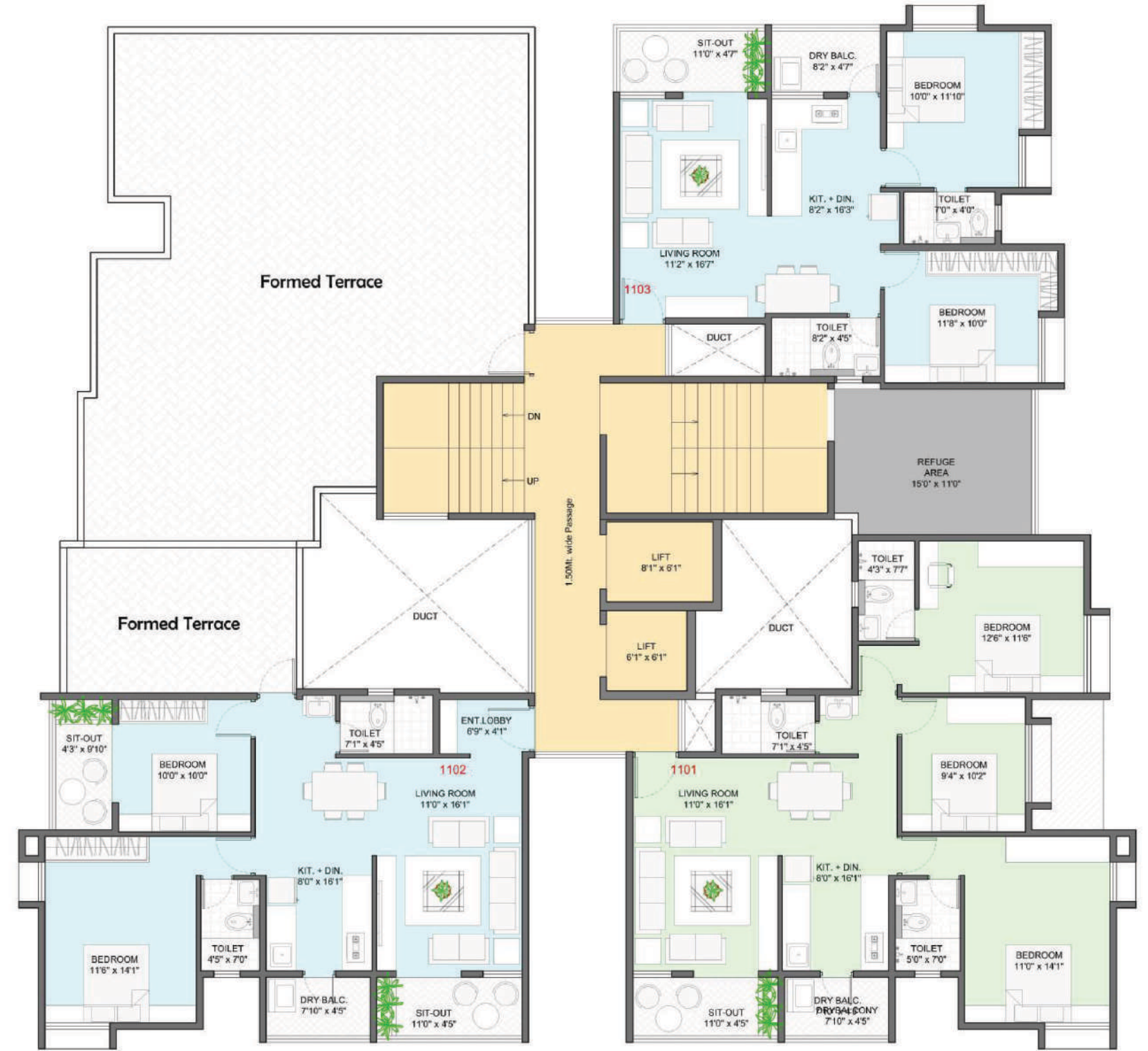
ELEVENTH FLOOR PLAN