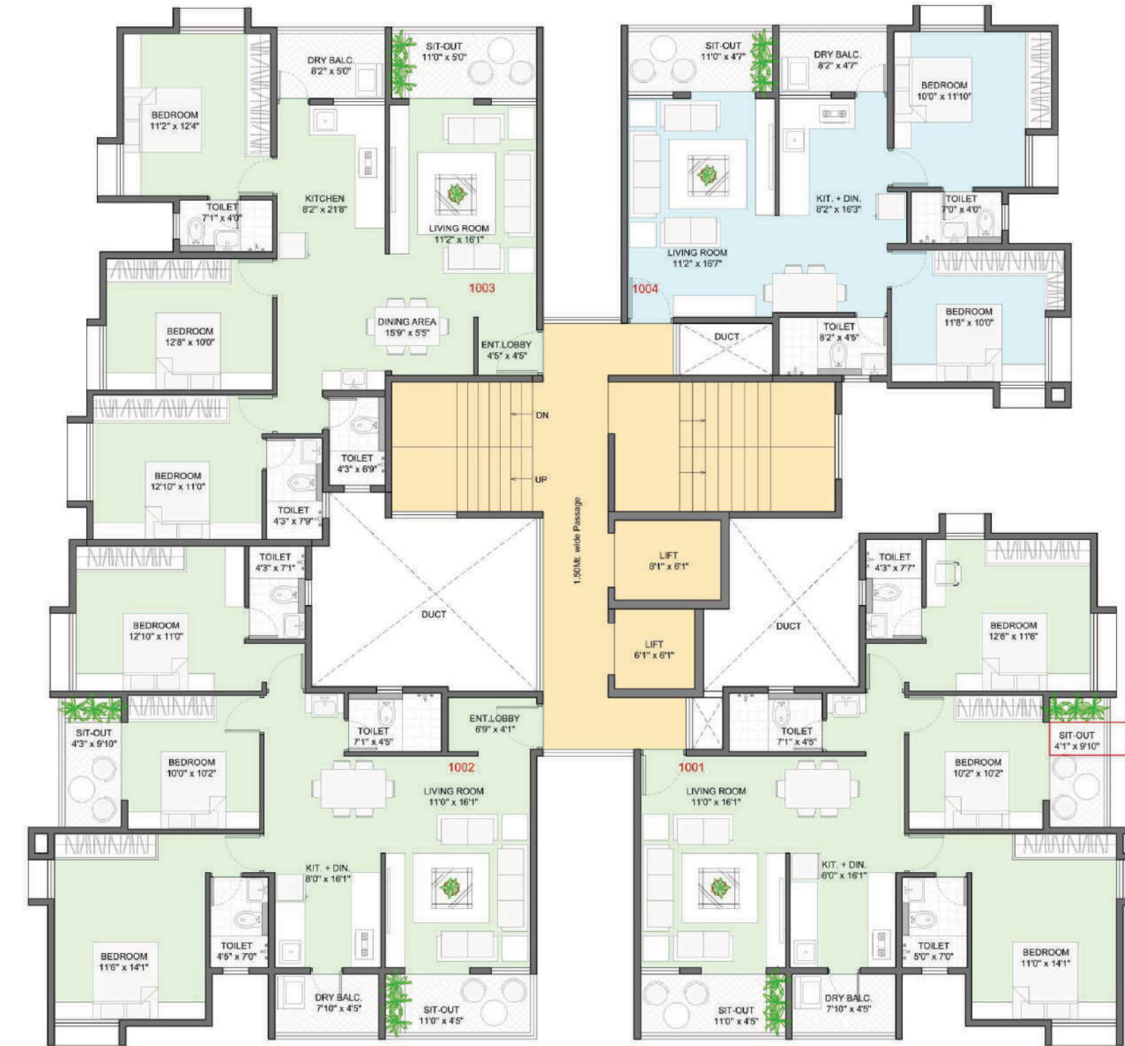
TENTH FLOOR PLAN