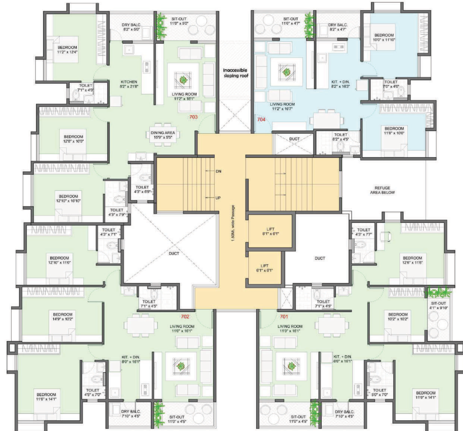
SEVENTH FLOOR PLAN